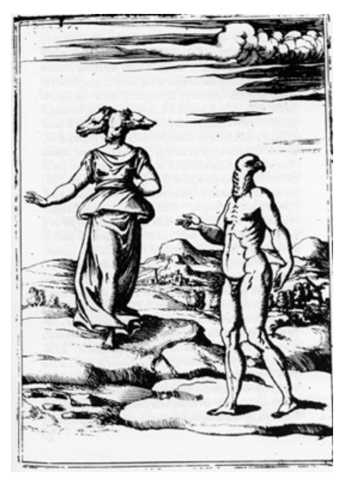
Figure 5: Bolognino Zaltieri, Diana and Apollo as moon and sun, from Vincenzo Cartari, Imagini dei Dei de gli Antichi, 1571.

In late antiquity the Roman cults also imported the Egyptian gods, the dog-headed Anubis, the hawk-headed Horus and Ra, the ram-headed Khnum. The Renaissance felt no need to purge these as alien or inappropriate: the ancient gods to the sixteenth century constituted an endlessly malleable symbolic repertory. The classical was a mode of expression enabled by a pantheon of meaning.