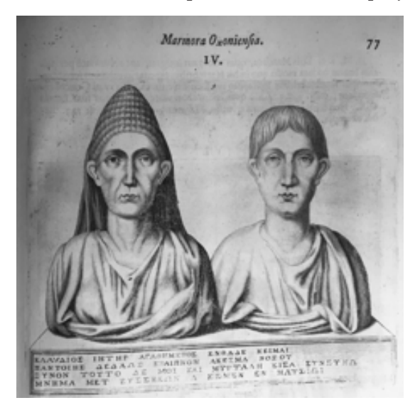
Figure 3: The Arundel Marbles: a tomb sculpture, from Humphrey Prideaux, Marmora Oxoniensia, ex Arundellianis..., 1676, p. 77.

the world more rare, from the point of view of antiquity" (Magurn