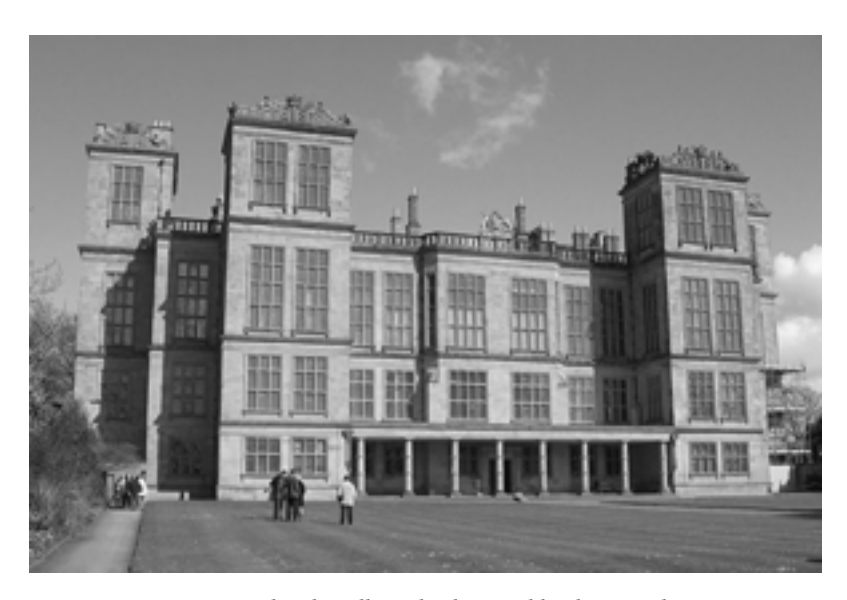
Figure 6: Hardwick Hall, Derbyshire. Public domain photo.