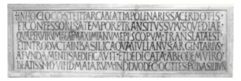
Figure 8: Late Roman inscription.

moved from the slapstick of The Comedy of Errors to the poetic passion of Twelfth Night . Just as Renaissance Latin was a vernacular, the classical style was a mode of expression, based not on a set of rules, but on a repertory of infinitely adaptable models.