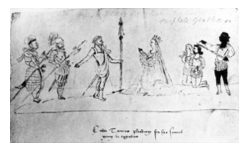
Figure 10: Henry Peacham (?), a composite scene from Titus Andronicus, 1614.

Let us look, in conclusion, at the astonishing remnant in figure 10, the only surviving drawing of a Shakespeare play from Shakespeare's lifetime. It looks like a scene from Titus Andronicus, but in fact it combines a number of actions, and gives a conspectus or epitome of the play as a whole – it is accompanied by a text that combines material from acts 1 and 5. This drawing is not an eye-witness sketch of Shakespeare on the stage; but it shows how a contemporary imagined Shakespeare in action, and is certainly informed by a theatregoer's experience. The costumes seem to us a hodgpodge, but they indicate the characters' roles, their relation to each other, and most important, their relation to us. A few elements are included to suggest the classical setting, but there is no attempt to mirror a world or recreate a historical moment. There is a Roman general at the centre, a medieval queen, two prisoners and their guard in outfits that are a mixture of Roman and Elizabethan; and the soldiers on the left are entirely modern.