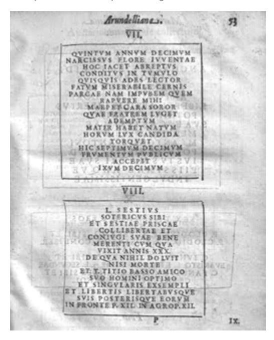
Figure 2: An illustration from John Selden, Marmora Arundelliana, 1629.

(1629: 53). Peacham continues, "You shall find all the walls of the house inlaid with them and speaking Greek and Latin to you. The garden especially will afford you the pleasure of a world of learned