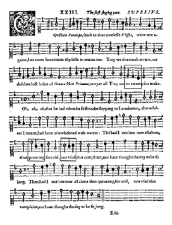
Figure 1: "Constant Penelope," from William Byrd, Psalms, Sonnets and Songs of Sadness and Piety, 1588. The metrical corrections are outlined.

Figure 1 is one of the surprises: in 1588, William Byrd published a setting of a bit of Ovid's Heroides, the opening eight lines of Penelope's epistle to Ulysses, translated by an anonymous poet into English quantitative measures. Byrd understood the scansion perfectly, setting long syllables to minims and short syllables to crochets. The music even corrects three errors in the metrics.<sup>6</sup>